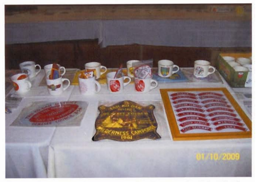
Mugs, patches, township shoulder strips, and much more, at the patch auction !!