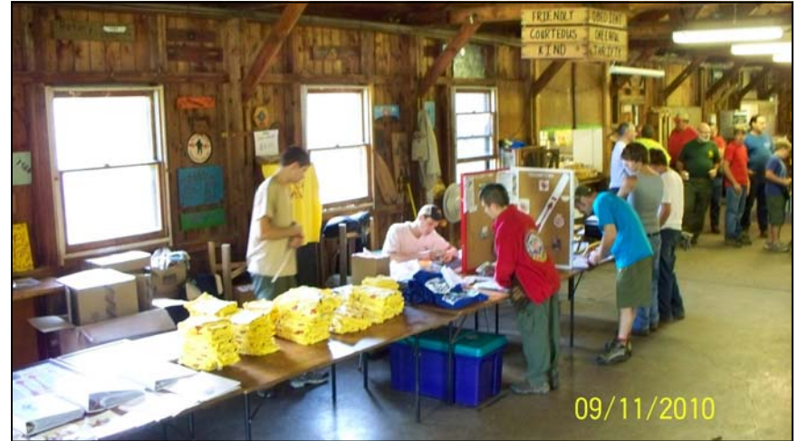
Registration and Lodge Trading Post at the Fall Weekend held at Camp Dittmer.