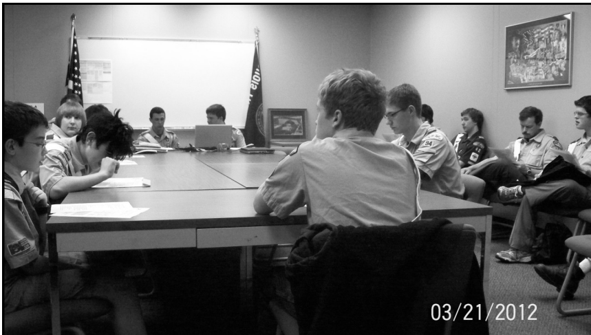
Order of the Arrow Troop Representatives (at table) discuss Lodge business at the March 21 Lodge Executive Committee Meeting. All OA Troop Representatives are encouraged to attend the monthly LEC's.